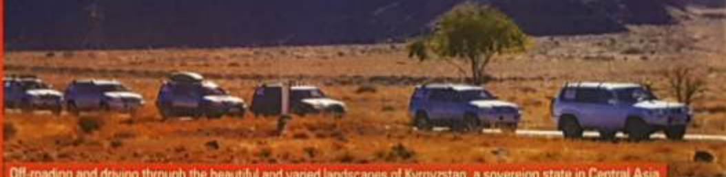
Off-roading and driving through the beautiful and varied landscapes of Kyrgyzstan, a sovereign state in Central Asia

Elated with people's perception about road-tripping, the duo is also happy that more and more women are coming forward to take road trips. Hence, to serve such a crowd, Embarq is organising an all-India women's drive from India to Thailand during mid-October this year. This road trip can be done by both car and motorcycle. The road trip will be starting from Guwahati, India and ending in Bangkok, Thailand, covering a total distance of 2,800 kms. This will be a pioneering trip as it is the first all-women trip, conceptualized and planned by women.